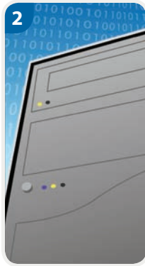
Weather Reach Server