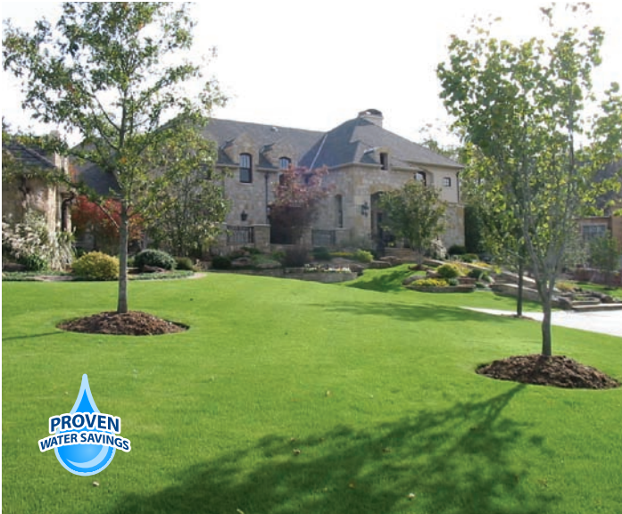
ET Manager connects to virtually any irrigation controller and allows your customers to save significant amounts of water without sacrificing the beauty of their landscape.