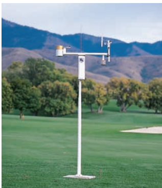
It's easy to become a Signal Provider - all you need is a compatible weather station and the server software.

Once you become a Commercial Signal Provider, you provide the data that enables ET Managers in your surrounding area.