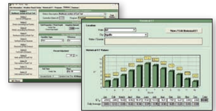
Free Scheduling Software