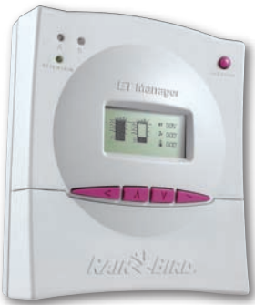
ET Manager (ETMi)

Although over-watering has always been something homeowners, public water agencies, property managers and landscapers tried to avoid, increasing water scarcity has brought this problem into the spotlight. No matter how efficient an irrigation controller's watering schedule is, however, it must take into account constantly changing weather conditions – specifically evapotranspiration (ET) and rainfall. ET is the amount of water lost from the soil through evaporation plus the plant's water loss (known as transpiration), both of which are dramatically affected by weather conditions. Rain Bird ET Manager™ uses current weather information and ET to water your landscape only when it needs it.