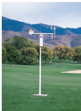
It's easy to become a Signal Provider - all you need is a compatible weather station and the server software.

Becoming a Public Signal Provider is easier than you might think. All you need is a compatible weather station or access to one, and the