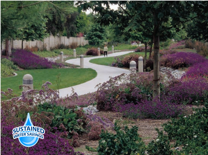
ET Manager allows you to provide sustained water conservation without sacrificing the beauty of local landscapes.