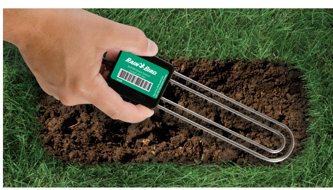
Learn more by visiting www.rainbird.com/SMRT-Y or contact your local Rain Bird Account Manager

Make any irrigation controller a water saving controller.