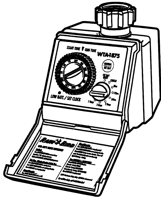
FIGURE 1: CONTROL PANEL

Please read this Owner's Manual completely before installing timer.